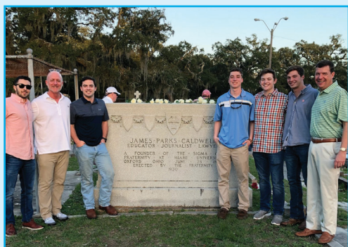
The executive committee at the Province Conference in Biloxi, Miss., in February 2018.