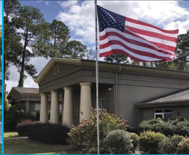
Gamma Sigma is proud to wave the biggest American flag on Auburn's campus in front of the chapter house.