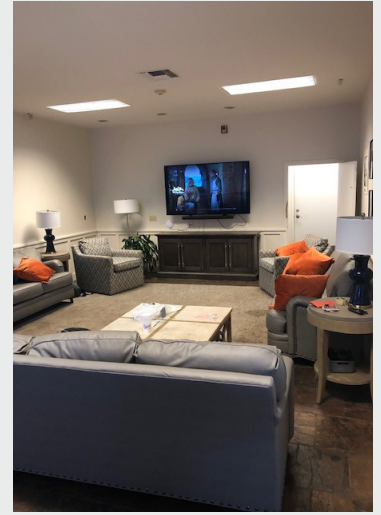
This view is to the right of the entrance. This used to be part of the old dining room.