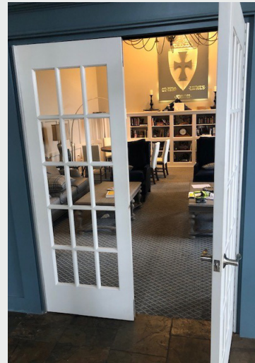
This is the formal study just off the foyer, which was the pool room.