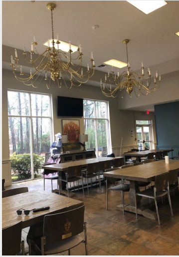
The new dining room, which is smaller than the old dining room.