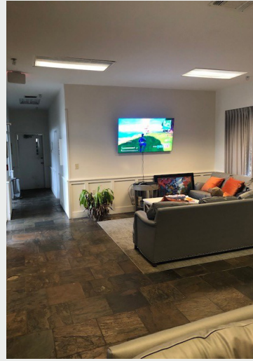
This was the old TV room with two walls removed.